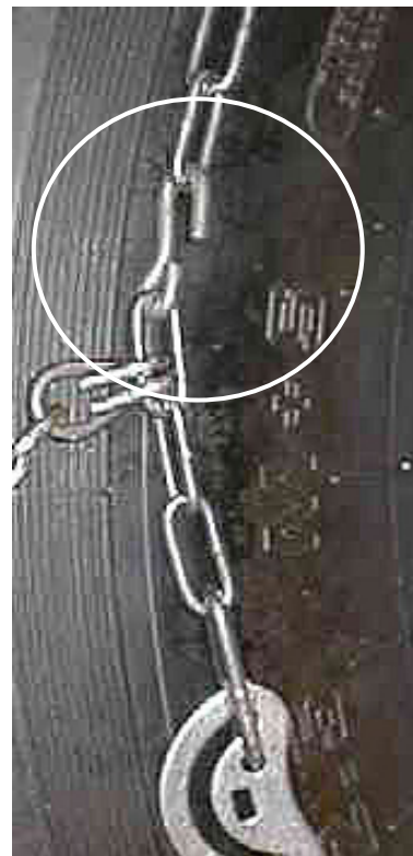
Connect the sidechain